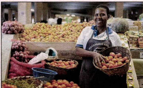
One of the tomato vendors in Busega Market who benefits from Success Tribe